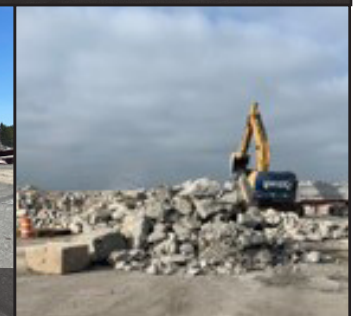
Hangars 15 & 16 demolition