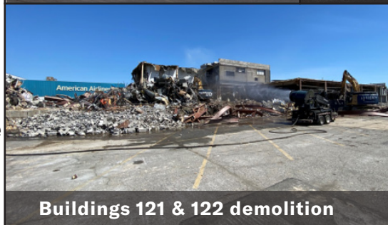
Buildings 121 & 122 demolition