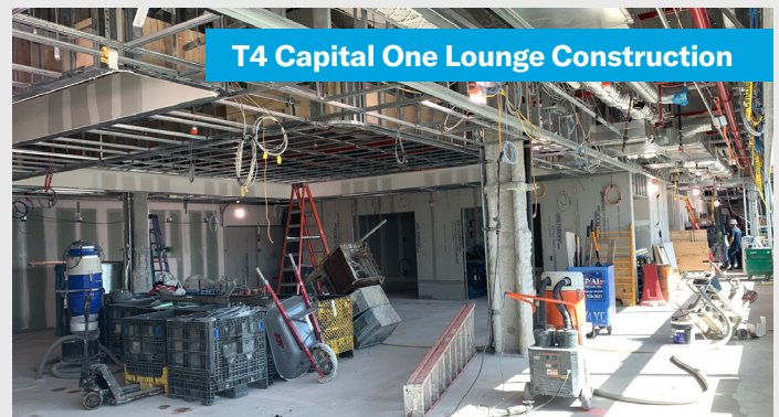
T4 Capital One Lounge Construction

The holdroom finishes in Concourse A and B are ongoing and expected to be finished early next year. The West retail hall construction has been completed, while ongoing construction at East retail hall with completion estimated by end of 2024. Construction also continues at the Capital One Lounge. Work on the Terrazzo floors in the bathrooms began, with hopes to be completed in the next couple weeks.