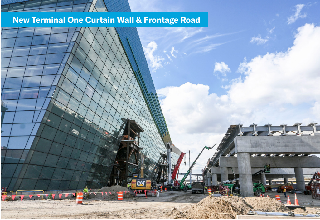
New Terminal One Curtain Wall &amp; Frontage Road